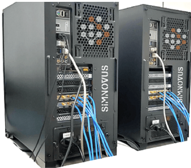
Network Emulator platform

Network emulator Mini and Classic run on customer-sourced COTS hardware with Intel i7 CPU